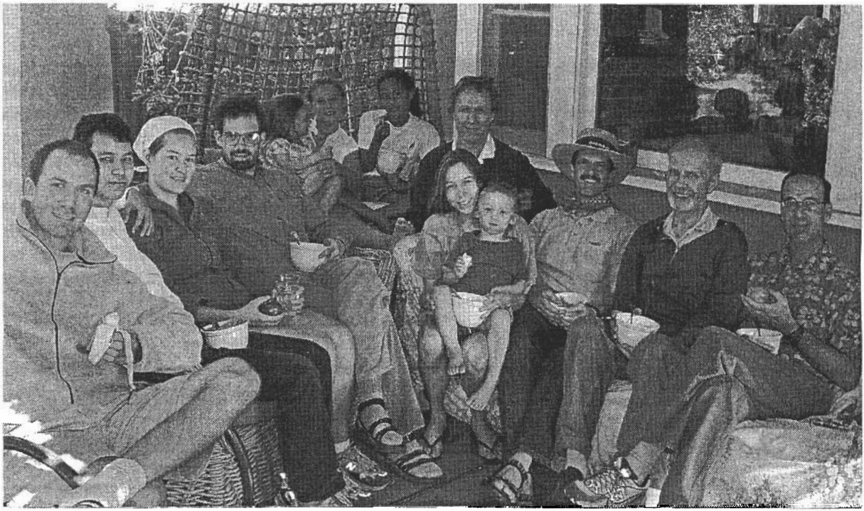
Magicians and guests interrupt lunch on the front porch for a group photo.